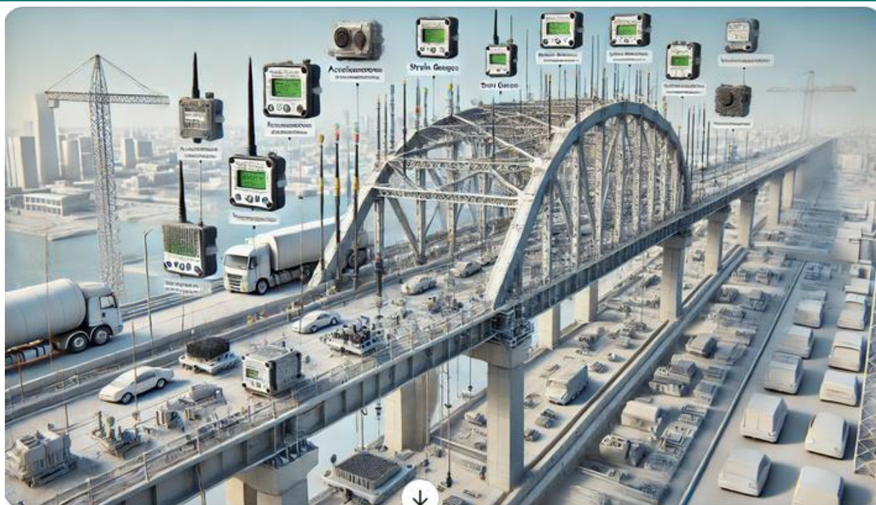
Figure 3.2 Examples of SHM Sensors on Structures

Figure 3.2 showing examples of Structural Health Monitoring (SHM) sensors installed on a structure, like a bridge or building. It includes various sensor types, such as accelerometers, strain gauges, and temperature sensors, each labeled to illustrate their monitoring functions.